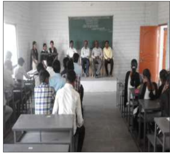
Students were able to understand Improvement of Academic Performance in exams and learning skills. Students were able to understand critical thinking and communication skills