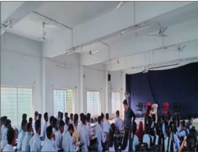
Department of English taken Special Class on comprehensive English reading for Slow learners and Advance Learners as class room activity.

6. Problems Encountered and Resources Required The main issue in implementing this practice was the identification of weak learners. Students may score poorly in the first tests for various reasons, including the stress they face as they enter a new institute. Another issue was not to make some students feel that they are weak in studies. This was overcome by introducing the remedial program without naming it as remedial. Besides, all students had some sort of additional coaching. So, all felt that the additional coaching was part of the practices of the college.