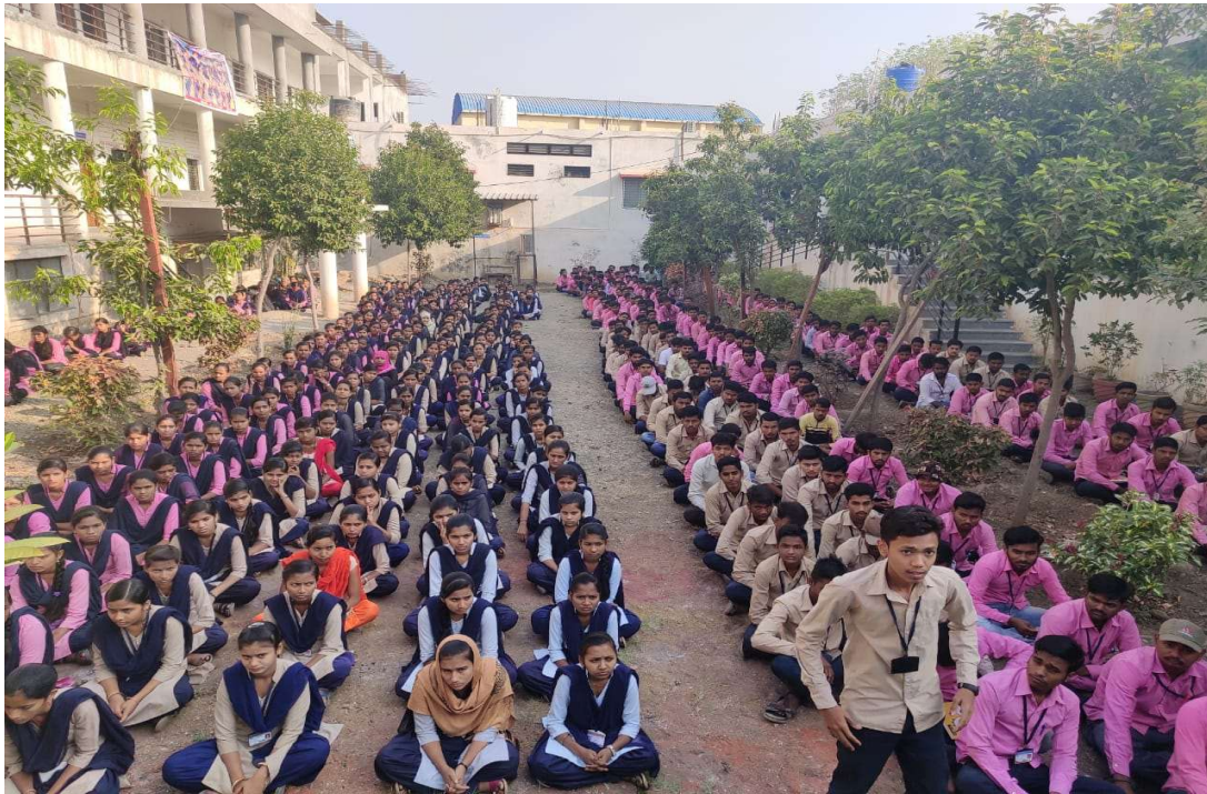
Morning inside view of assembly

Objectives: Morning assembly conducted regularly which clarifies everyday college activities and lays out programme focusing on cocurricular activities. It strengthens the way a college works. It is conducted with a complete and active participation of students and faculty. It is well planned and carefully conducted putting a light on various aspects of college activities. Education does not simply mean the ability to read and write. It is a wide term used to describe the complete process of development.